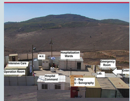
■ military field hospital