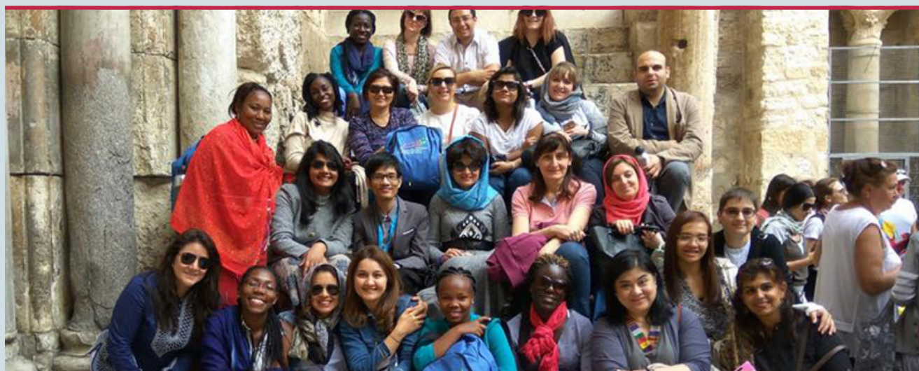
■ Participants in the first international course on innovations in women's health.

facilities, lack of primary health care, societal and cultural norms, and inadequate policies and funding that often make women reluctant to seek services.