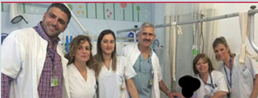
■ Celebrating a Syrian teenager’s birthday at Ziv Medical Center

We thank all those who were involved in this project.